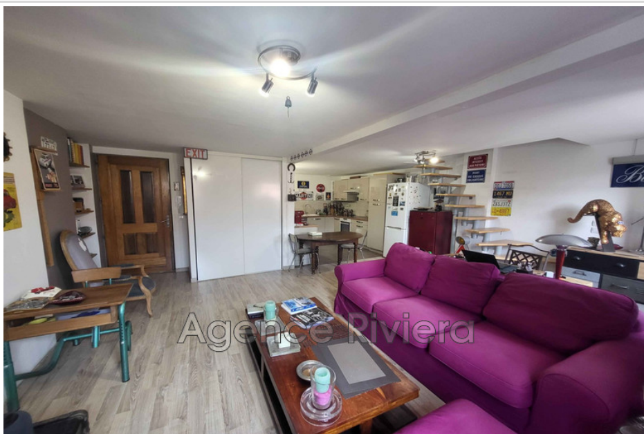
Apartment 262052024 La Ciotat

EXCLUSIVE APARTMENT FOR SALE IN THE HEART OF THE TOWN OF LA CIOTAT , IN ABSOLUTE QUIET WITHOUT OPPOSITE . Magnificent VERY BRIGHT Apartment on the 2nd and LAST FLOOR OF THE BUILDING , INCLUDING A LARGE SOUTH FACING LIVING ROOM, Cupboard and cloakroom at the entrance, fully equipped and fitted OPEN KITCHEN. Upstairs: TWO PRETTY SPACIOUS BEDROOMS WITH STORAGE AND WARDROBE. A bathroom with storage, and a separate toilet. FEW EXPENSES . OPPORTUNITIES FOR SEASONAL RENTAL.